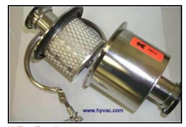
HyFlow Trap Apart